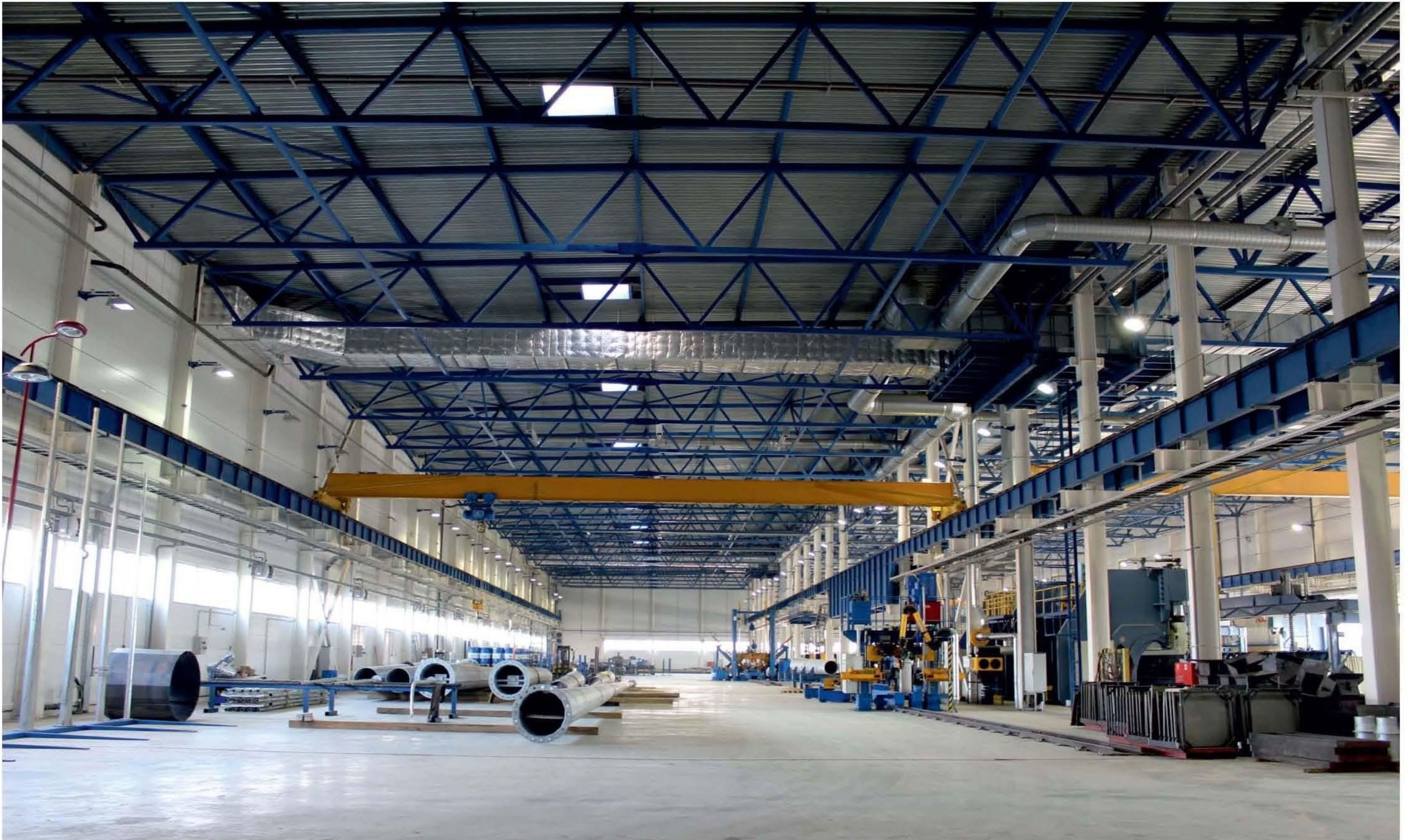
Pre-assembly area for high mast